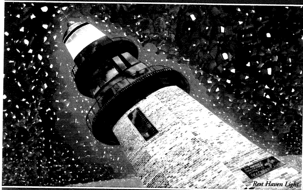
Rest Haven Light